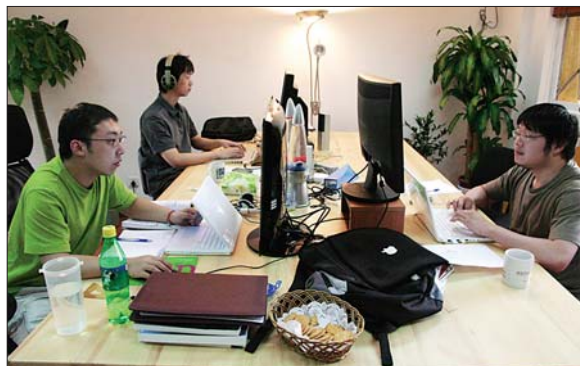
Happylatte software developers in Beijing work on new applications for the iPhone. Jules Quartly

"All telecom operators are afraid of the disruptive nature of the iPhone, as it can marginalize telecom operators to mere 'dumb pipes' with application revenues going to Apple and to